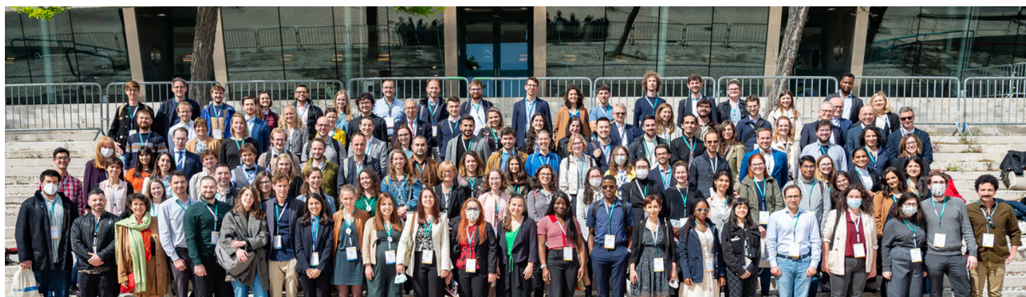
Photo of the participants of the 2022 ECCMID TAE Day session in Lisbon, Portugal